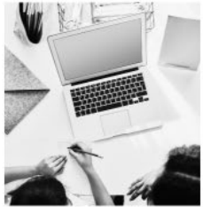
Financial & Bonding Assistance