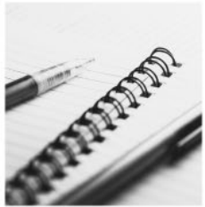
Access To Contracts